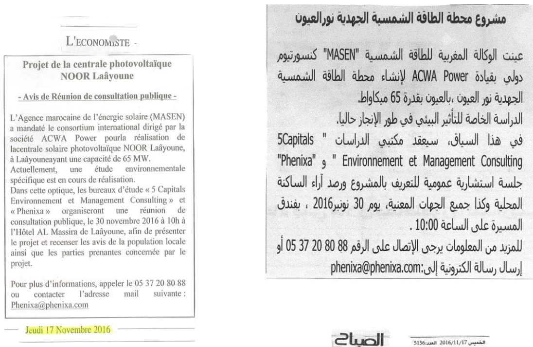
Figure 1 Public Consultation Meeting Notification

Adverts were published in one regional and one national newspaper for announcing consultation activities for the SESIAs. The notices (figure below) were published in Arabic and French for a week. In addition, invitations were sent to the identified stakeholders in the Dchira Commune and Laayoune.